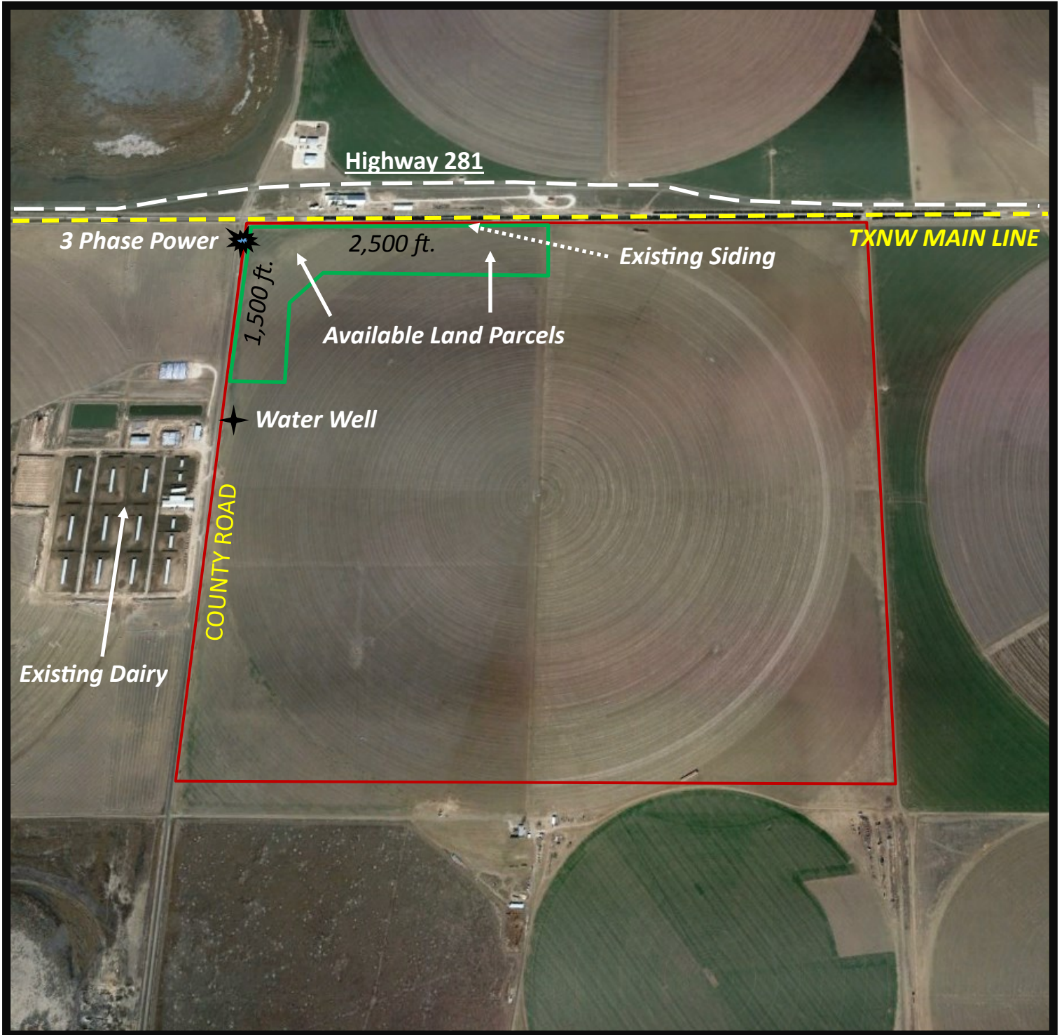
EXHIBIT "A" Flexible +/- 10 Acre Options